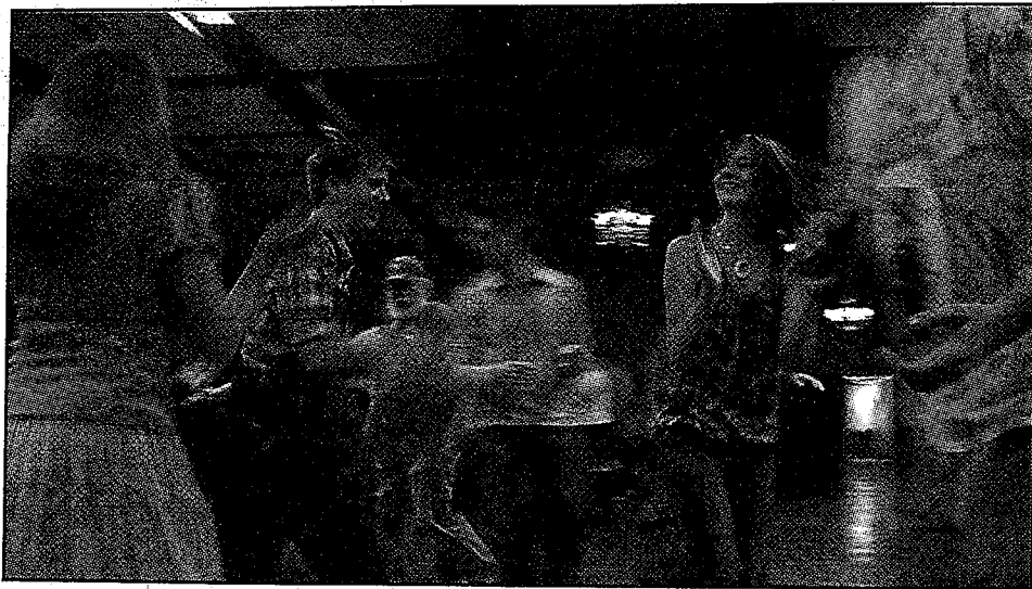
Red Dirt Contradance, a club that practices a lively form of traditional English country dancing, hosts community dances accompanied by live musicians on the the third Friday of each month. The monthly events, held at the Stillwater Community Center, run from 8 to 11p.m. with a class for beginners starting at 7:45p.m. The next dance is January 18. For more information about Red Dirt Contradance events, go to www.facebook.com/groups/acontraaffair.